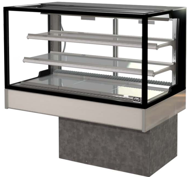
SHOWING : 3000 SERIES REFRIGERATED 1200mm SQUARE, WITH FIXED FRONT, ON COUNTER, WITH INTEGRAL CONDENSING UNIT