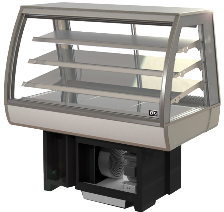
SHOWING : 3000 SERIES REFRIGERATED 1200mm CURVED, WITH FIXED FRONT, ON COUNTER, WITH INTEGRAL CONDENSING UNIT