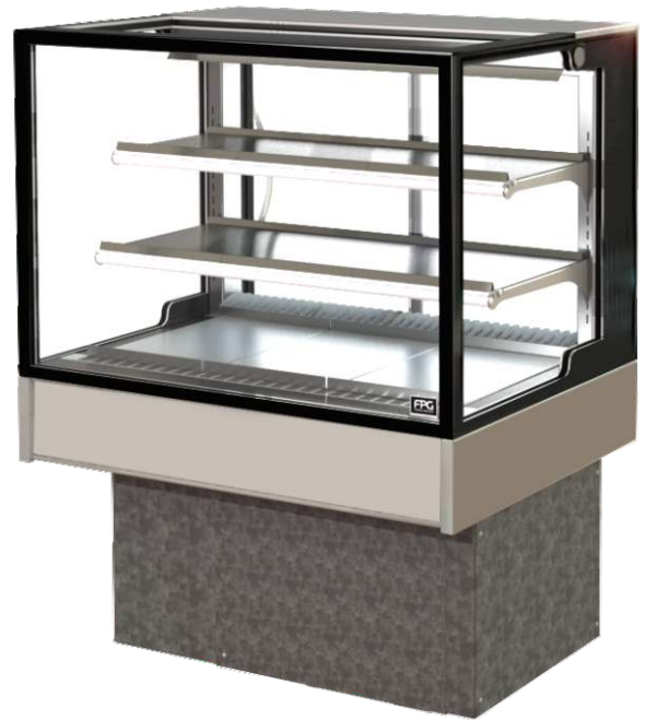
SHOWING : 3000 SERIES REFRIGERATED 900mm SQUARE, WITH FIXED FRONT, ON COUNTER, WITH INTEGRAL CONDENSING UNIT