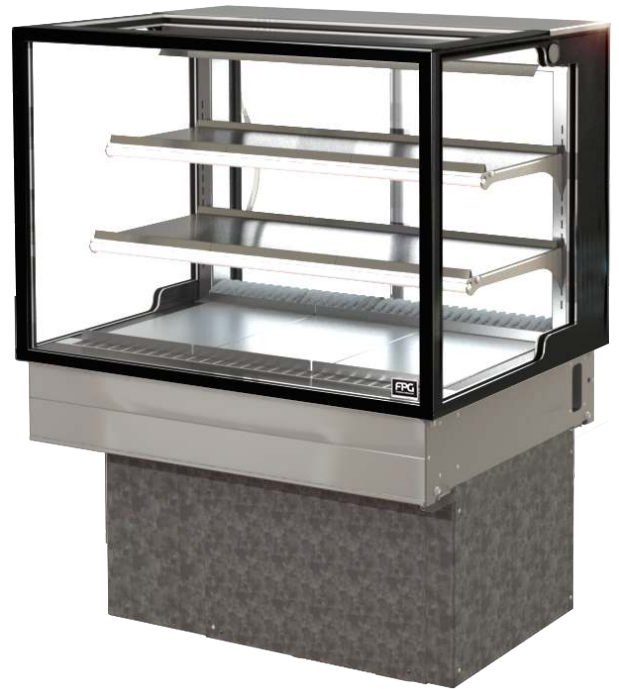
SHOWING : 3000 SERIES REFRIGERATED 900mm SQUARE, WITH FIXED FRONT, IN COUNTER, WITH INTEGRAL CONDENSING UNIT