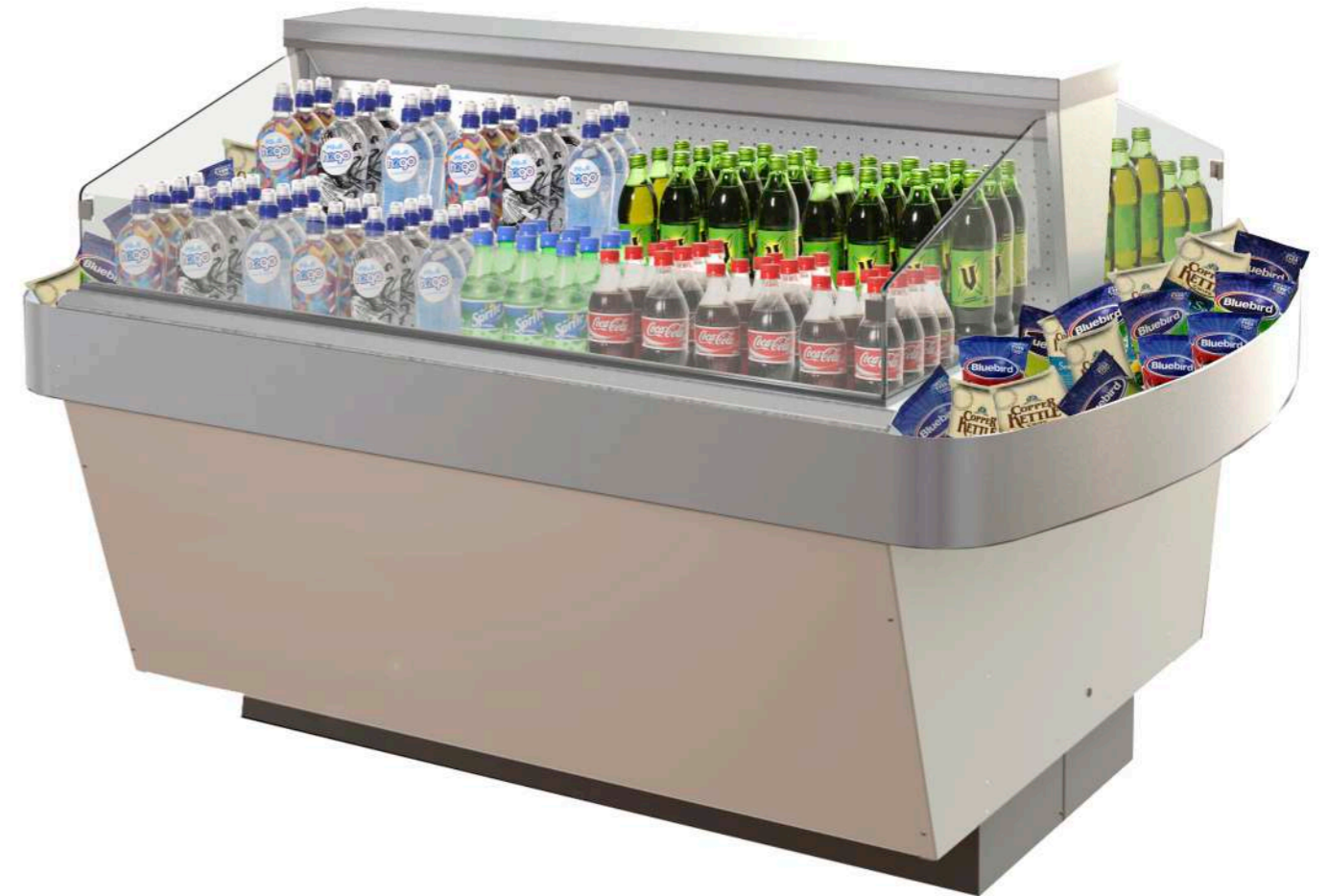
ABOVE : HYDRAZONE ISLAND, WITH AMBIENT ENDS

This high capacity cabinet is made for c-store and supermarket environments. The Hydrazone is the ideal grab and go cross merchandiser for a wide range of refrigerated product. This clever cabinet has auto evaporation so no drainage is required, plus energy efficient EC fans are used to minimise power usage. The Hydrazone is an easy to clean unit with optional ambient tumble bins for additional great cross merchandising potential.