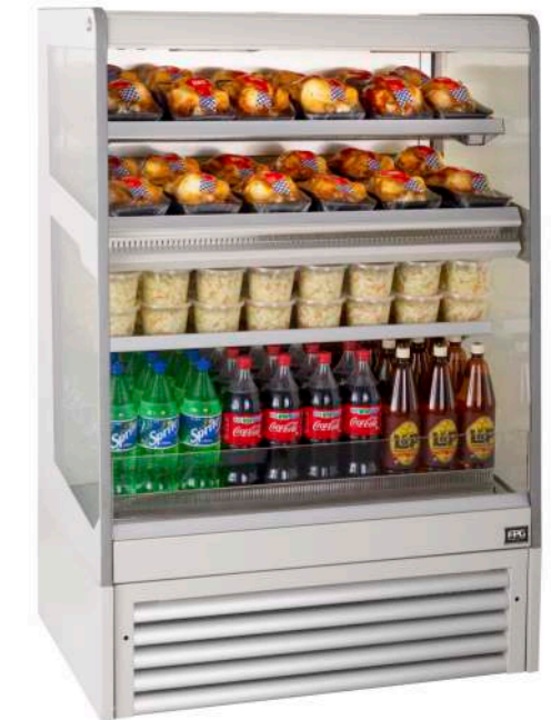
LEFT : FUSION - HEATED AND REFRIGERATED 1000mm CABINET RIGHT : FUSION - HEATED AND REFRIGERATED 1000mm CABINET